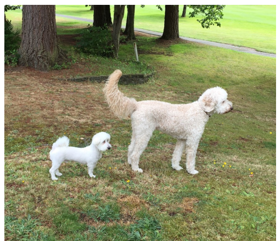
Pompey and Divot

P.S. Remember to join me on September 18th at 10:30am for “Pastries with the President.” No agenda, No donation, No catch. Just coffee, pastries (or something similar), and good conversation with your fellow Sangha members!